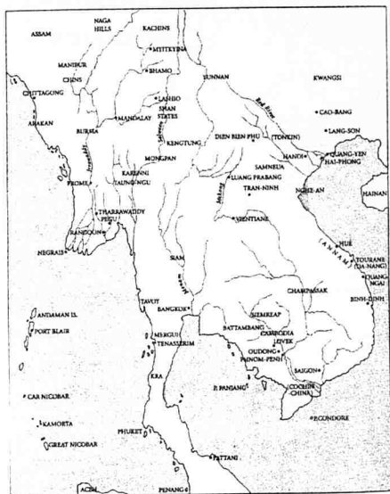
Mainland Southeast Asia, nineteenth and twentieth centuries C.E.